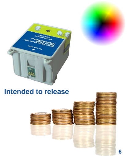
Intended to release